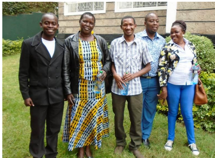
A group of Machakos community monitors

On numerous occasions, interviewed community monitors in Kwale and Machakos counties had physically shared their information and knowledge with and sensitized and mobilized communities to become interested in and be more active citizens in county governance and public participation mechanisms. Some of these citizens, in turn, also volunteered to become community monitors. Therefore, in both counties, the number of active community monitors – in Kwale also called “citizen journalists” - organically grew beyond the initial core group.